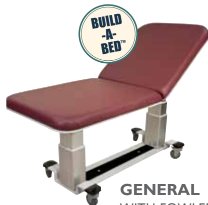
GENERAL WITH FOWLER