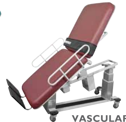
VASCULAR WITH FOWLER