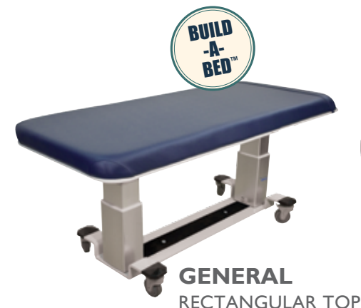
GENERAL RECTANGULAR TOP