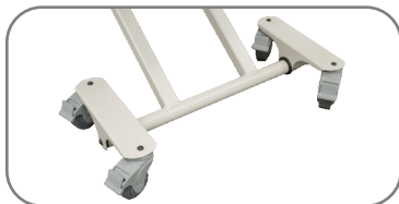
Optional casters allow the bed to be easily moved around in a room.