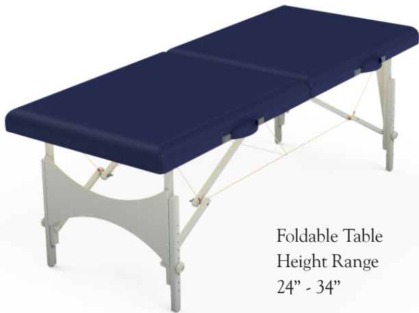
Foldable Table Height Range 24" - 34"

made in the USA with US & imported parts