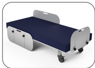
Shown with Optional Side Rails and Foot Board