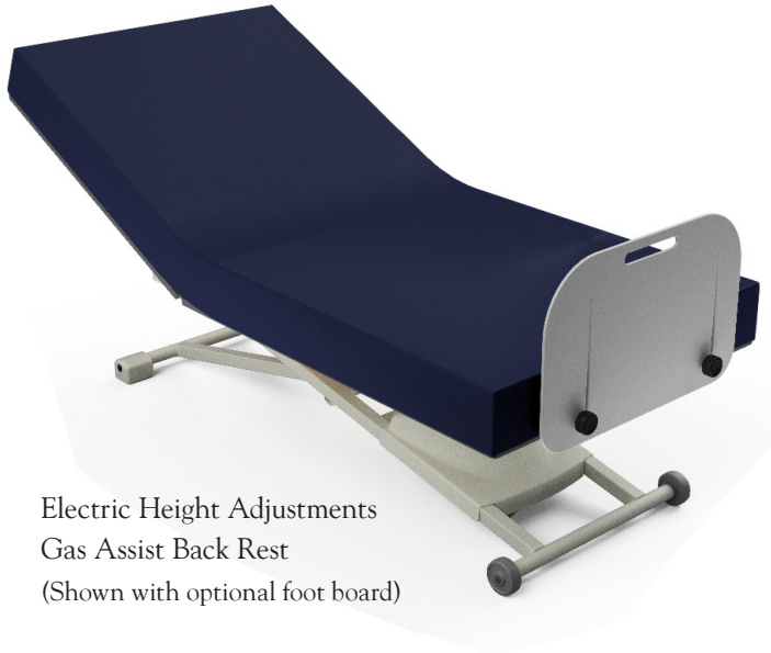
Electric Height Adjustments Gas Assist Back Rest (Shown with optional foot board)