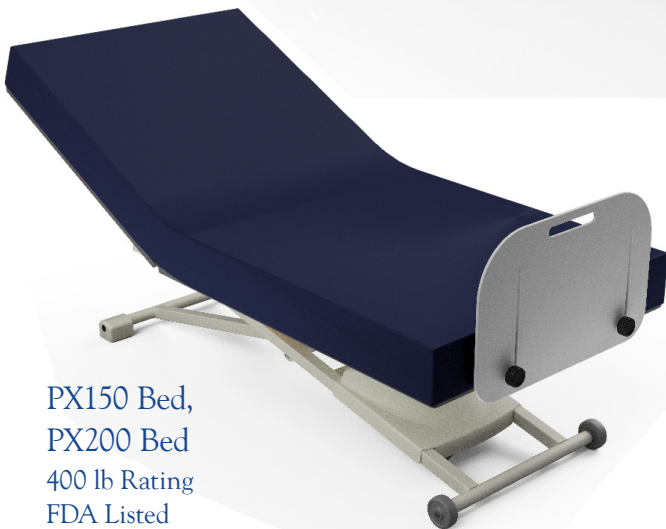
PX150 Bed, PX200 Bed 400 lb Rating FDA Listed