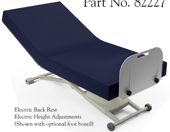
Electric Back Rest Electric Height Adjustments (Shown with optional foot board)