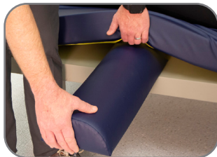
Bolster prevents patients from sliding down.