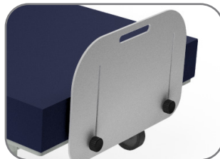
Adjustable and Removable Plastic Foot Board