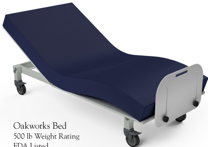
Oakworks Bed 500 lb Weight Rating FDA Listed (shown with optional foot board)