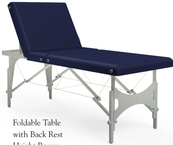
Foldable Table with Back Rest Height Range 24" - 34"