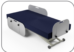
Shown with Optional Side Rails and Foot Board