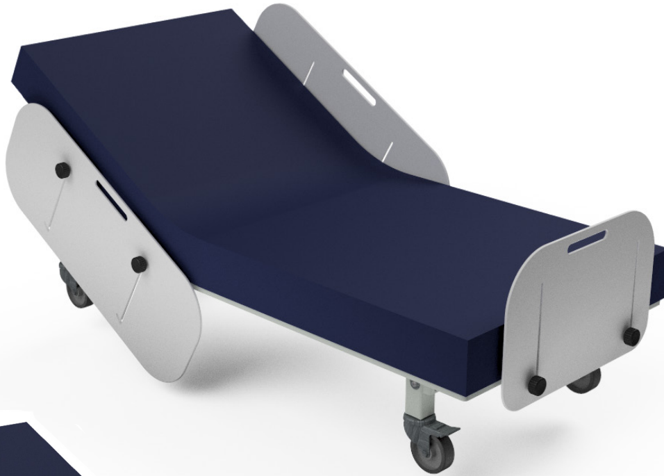
Oakworks Bed 500 lb Rating FDA Listed