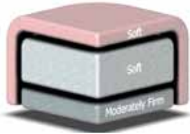
4" Comfort Foam™ Superior comfort and support