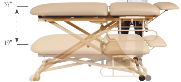
Large height range facilitates patient transfer & practitioner ergonomics.