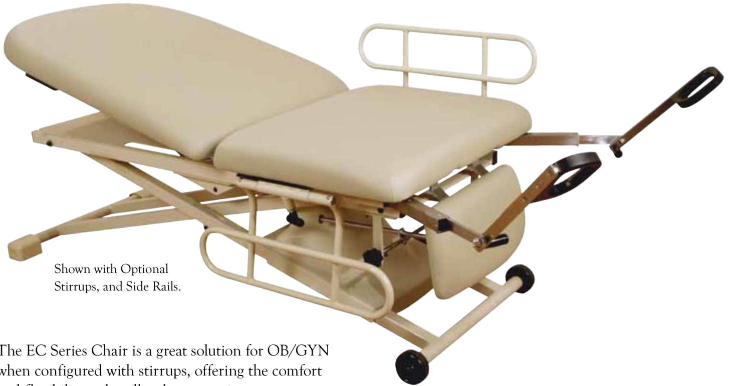
Shown with Optional Stirrups, and Side Rails.

The EC Series Procedure Chair is a cost effective solution for environments where flexibility and lower cost are important. This versatile chair can also be put in a flat table position. A wide range of options and accessories allow you to customize the product to your needs.