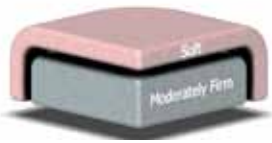
2.5" Comfort Foam™ Comfort and support