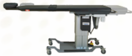
LONGITUDINAL TRAVEL CFPM301