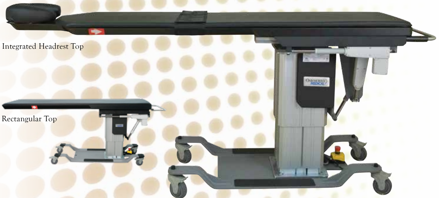
Integrated Headrest Top