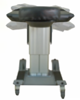
LATERAL TILT CFPM300