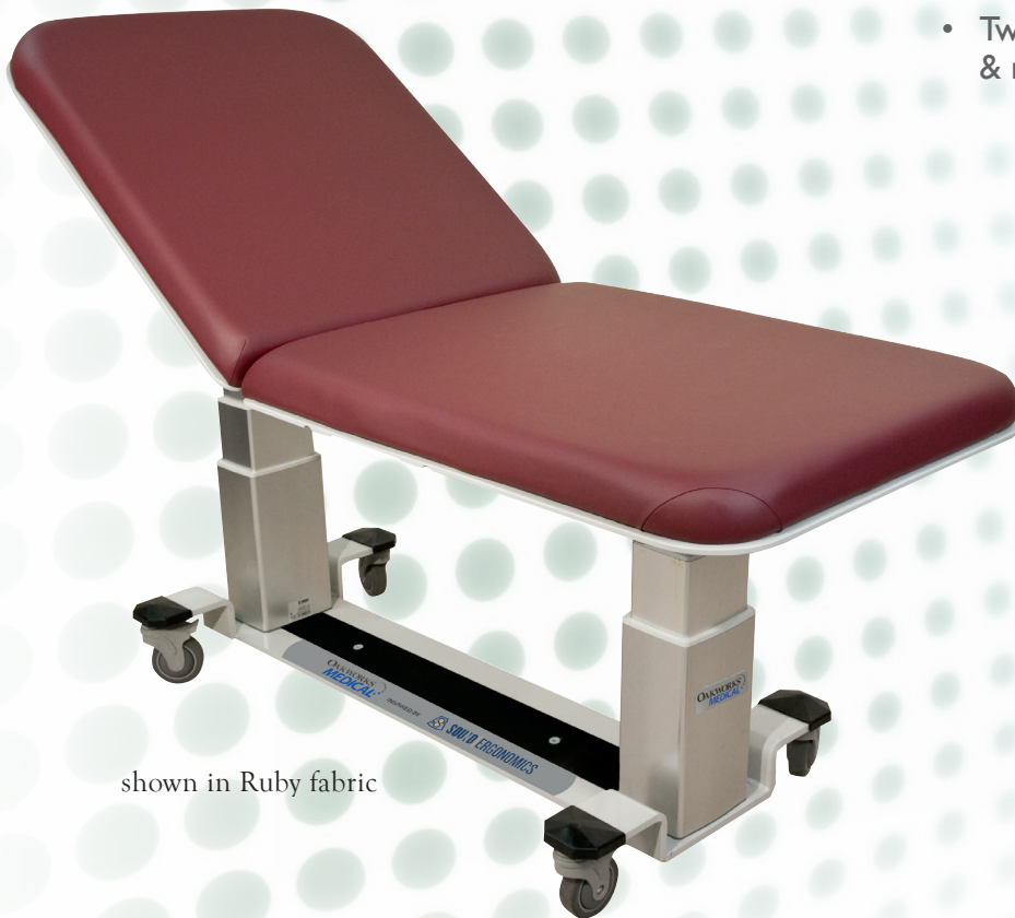
shown in Ruby fabric