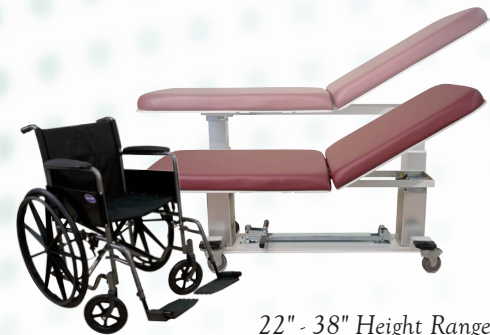
22" - 38" Height Range

Inspired by the leading ergonomic experts in sonography