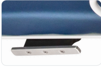
TABLE EXTENDER #63487-T*

Multiple locations allow you to choose the best spot for this easily installed & removed accessory capable of handling up to 150 lb (68kg). Can be used with any American standard accessory. 8" (20cm) long