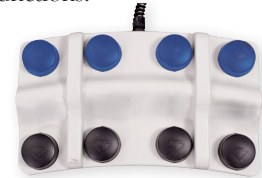
Multi-function foot control

You can add a foot control that controls all functions.