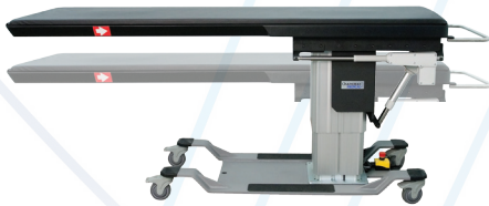
26" - 44" HEIGHT RANGE