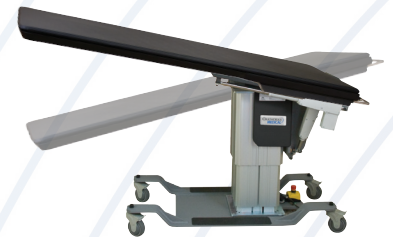
+15°/-11° TRENDLENBURG TILT