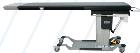
4" LONGITUDINAL TRAVEL